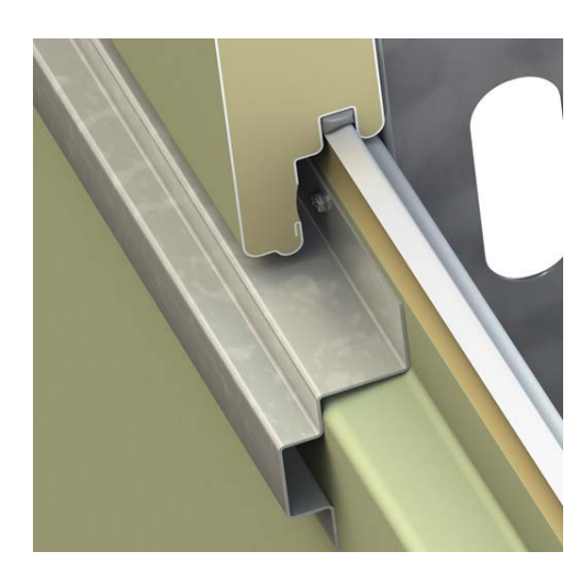
Figure 2: Examples of MetalWrap IMP product